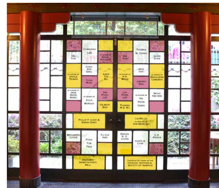
Proposed design for CHSA's 50th Anniversary Donor Wall, on the Garden Courtyard windows.

Founded in 1963, CHSA has grown to be our nation's leading organization dedicated to the documentation, study, and presentation of Chinese American history. In 2001, CHSA opened the CHSA Museum and Learning Center in the renovated former Chinatown YWCA designed by the famed architect Julia Morgan. The Museum serves as a permanent home for the story of Chinese in America with its galleries and collections. Your gift to the campaign will advance the sustainability of the Museum for years to come and secure the Museum's ability to preserve and promote the history of Chinese in America. WHAT THE 50TH ANNIVERSARY CAMPAIGN FUND SUPPORTS