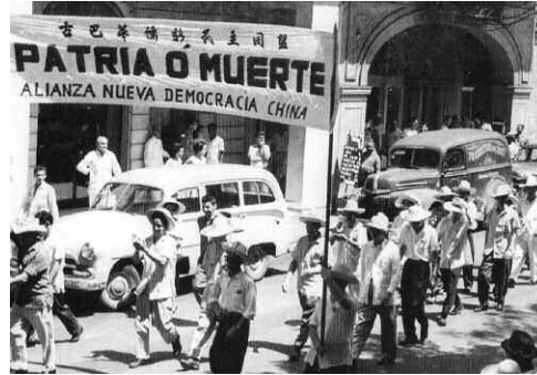
Demonstration by Chinese New Democracy Alliance, July 10, 1960.

Book Event & Panel Discussion Saturday, September 9, CHSA Learning Center, time TBA