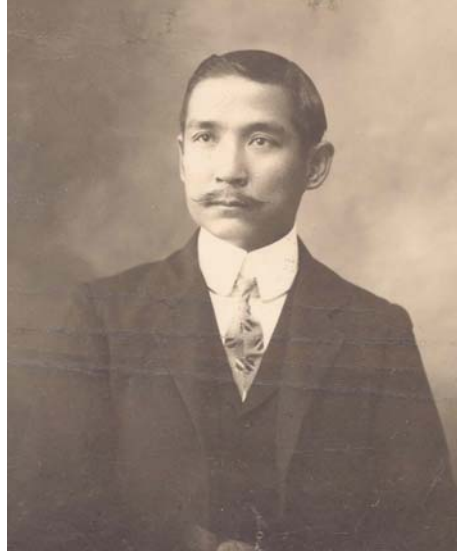
Dr. Sun Yat-Sen

Read the following passage. Underline any new vocabulary words and discuss with your class what you learned.